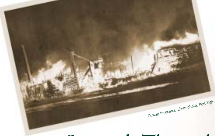
Cowan Insurance. claim photo. Port Elgin.