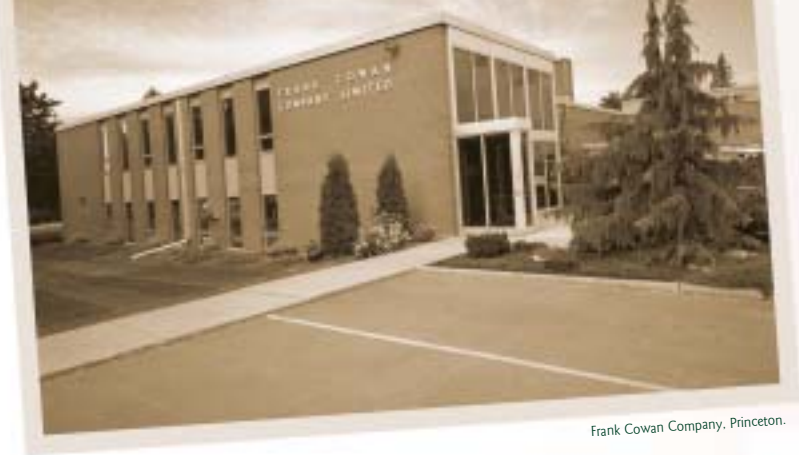
Frank Cowan Company, Princeton.