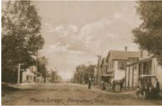
Princeton, Ontario, circa 1908.