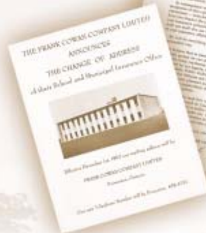
Change of address announcement, Princeton, 1962.