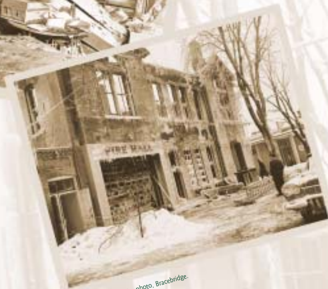
Cowan Insurance. claim photo. Bracebridge.