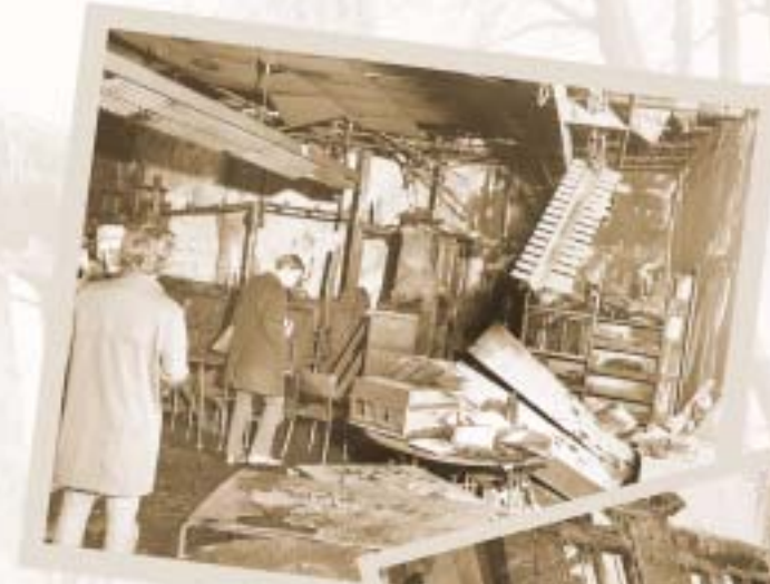
Cowan Insurance. claim photo. Petrolia.

awards, coupled with depressed premiums, resulted in a subsequent period of soaring insurance premiums. Another period of rate cutting occurred throughout the 1990s, and thus the opening years of the twenty-first century have again seen insurance premiums rising significantly. The solid footing of the company has enabled it to weather these slumps, ready for returning clients when the Cowan advantage is brought to light.