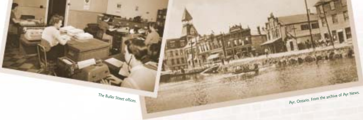
The Buller Street offices.