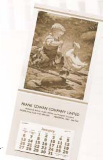
The "Cowan Boy" calendar was associated with the company for decades.

the kind of growth the company has experienced since its earliest days as a one-man undertaking. Up sharply from the dozen or so in 1962, employees in Princeton numbered approximately eighty in 2002. Ten thousand square feet on two levels, the new office featured a fully open-plan work area, and was quite up-to-date, having been outfitted with several modern technological conveniences.